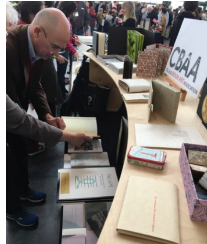
Above: close-ups of the CBAA table and visitors

Because the CBAA Membership Showcase consisted of such a wide range of work, many young people and students inquired about the organization. Having student and new graduates' work alongside professionals really helps to pique interest because 1) one can see a progression and divergence of craft and content 2) dispels some of the myths of the "master artist" 3) shows that CBAA values and encourages students and young artists.