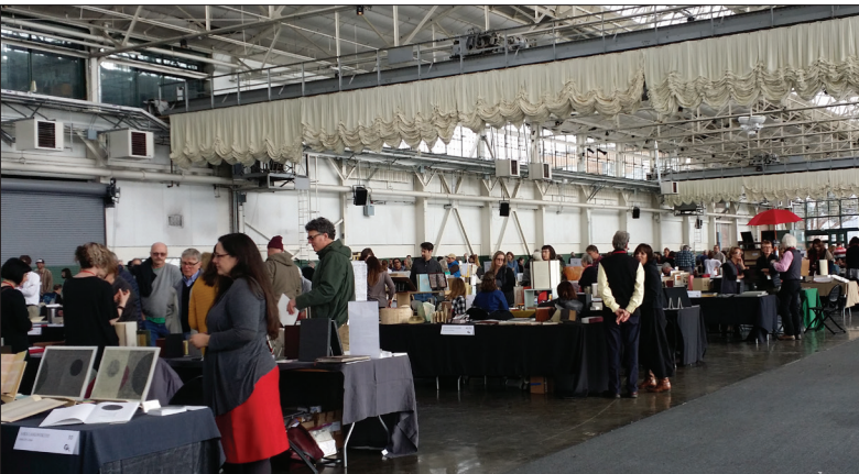
Above: The CBAA table at CODEX and view of fellow exhibitors

The Codex Book Fair and Symposium took place February 5-8, 2017, at the Craneway Pavilion in Richmond, California. The Codex Foundation was founded in 2005 by fine press printer Peter Koch, and paper conservator Susan Filter, in order to create an environment for promoting the book as a work of art. The Codex Book Fair and Symposium was initiated in 2007 with over 100 exhibitors and roughly 700 visitors. Since then, Codex has been ranked as one of the top book fairs in the world. Thousands of visitors attend the public book fair, and tickets sell out every year to the Symposium, which features presentations from top book artists and professionals.